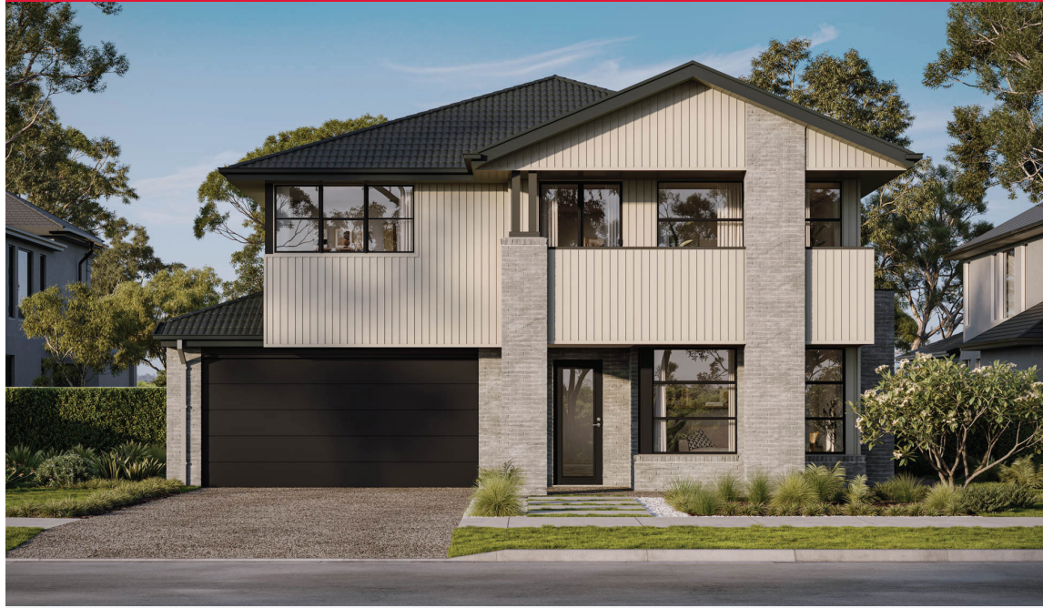
SILVERTON 45 | ELITE RANGE