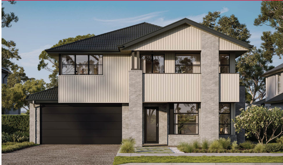
SILVERTON 45 | ELITE RANGE