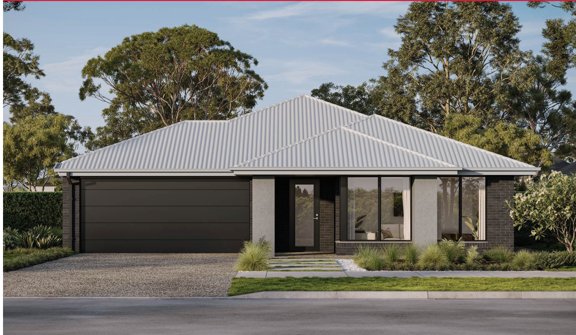
WILLANDRA 34 | ELEVATE RANGE